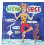
The gentle Heart